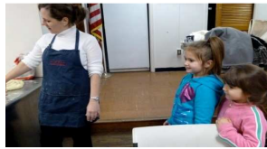
They're delicious !!!

More from last pirozhki workshop Never too early to learn