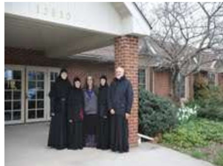
In front of church entrance